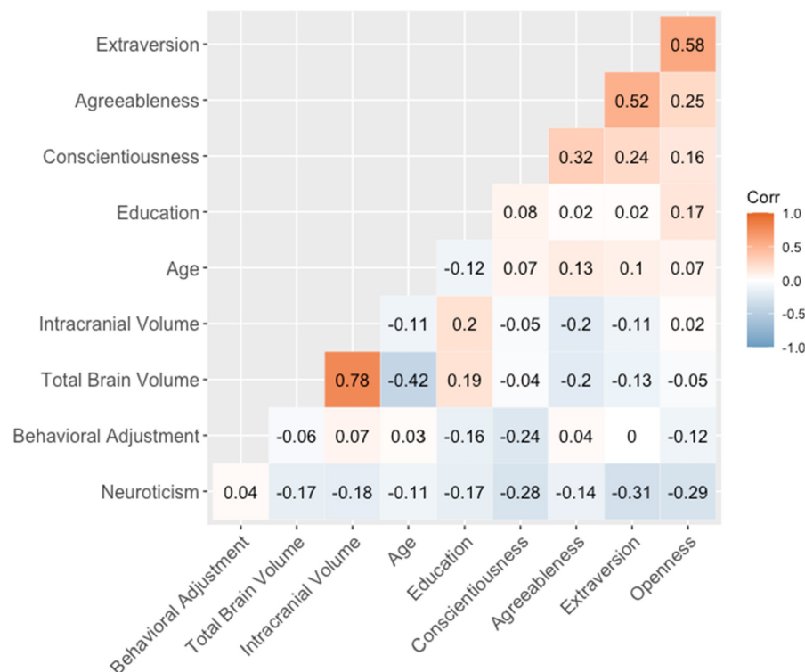
FIGURE 1 Pearson correlation coefficient of all continuous variables in the present study ( n = 125 ).

The images were also spatially normalized to conduct a whole-brain voxel-level analysis on neuroticism and behavioral adjustment. Details for the procedures and the results can be found in Supporting Information .